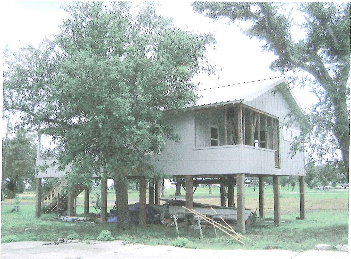
RIGHT SIDE / REAR VIEW